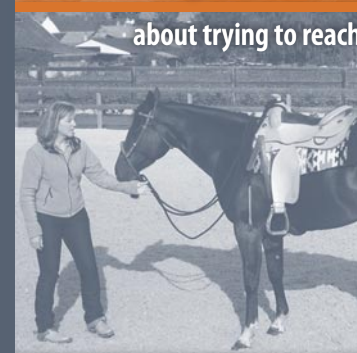
about trying to reach