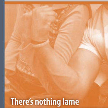
There's nothing lame